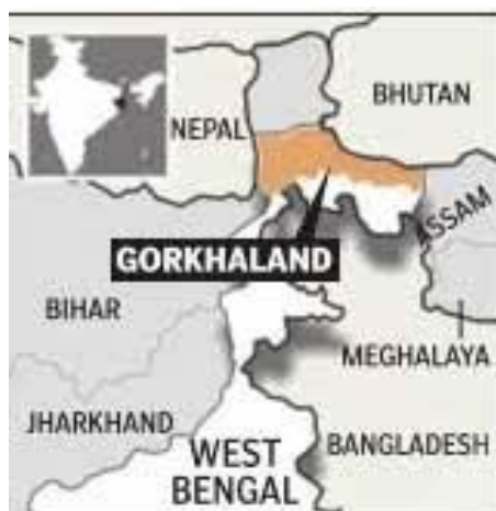
Gorkhaland in northern West Bengal

News: Gorkha Janmukti Morcha (GJM) claimed that the Centre agreed for a tripartite meeting to discuss various political issues concerning the Gurkhas, including the demand for a separate State of Gorkhaland.