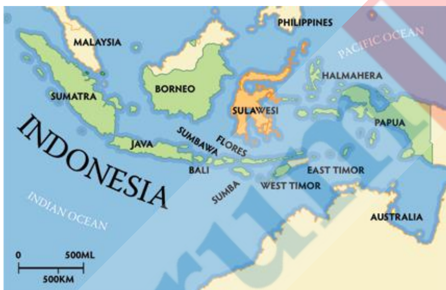
Location of central sulawesi province on the Indonesian map

3. Operation Samudra Maitri: It is an operation launched by India to provide naval and air assistance to the survivors of earthquake and consequent Tsunami in Central Sulawesi province of Indonesia.