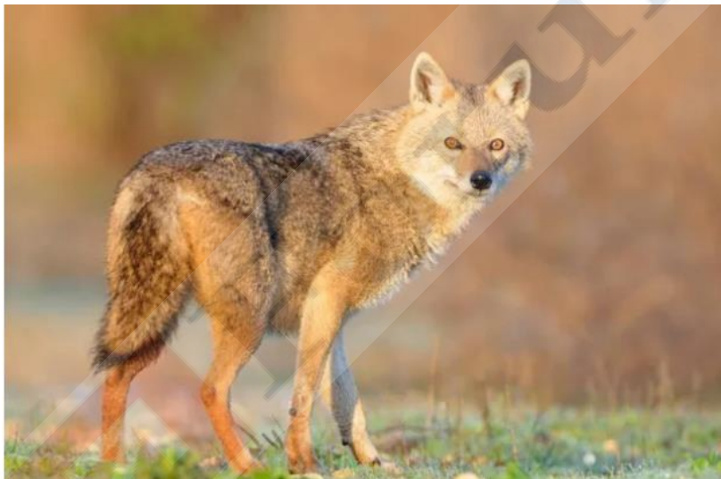
Figure 6.