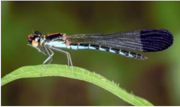
Figure 5.