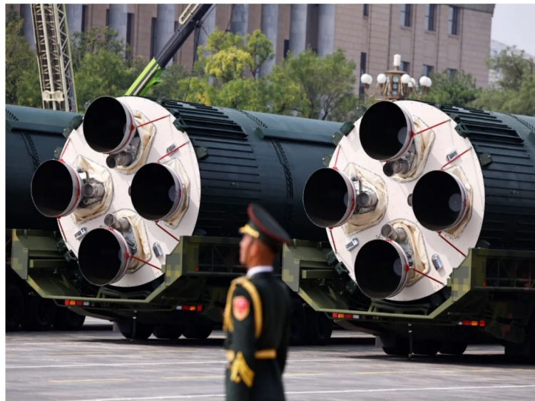
Displaying nuclear missiles during a military parade in Beijing,