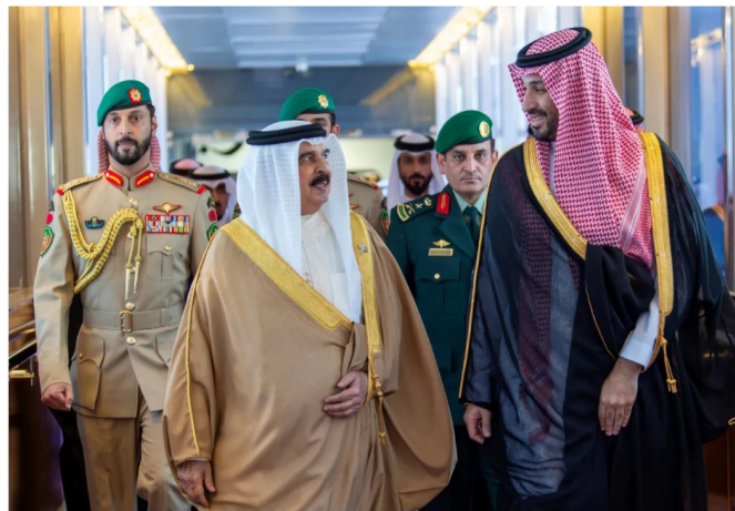
Bahrainian King Sheikh Hamad bin Isa al-Khalifa and Saudi Crown Prince Mohammed bin Salman in Iddah, Saudi Arabia. April 2026